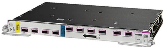
Figure 2. 10-Port 100-Gbps Multiservice Line Card with Cisco AnyPort Technology and CPAK Optics