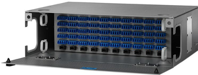
Figure 3. Cisco NCS-PP-100X10-SR MMF Break-Out Panel