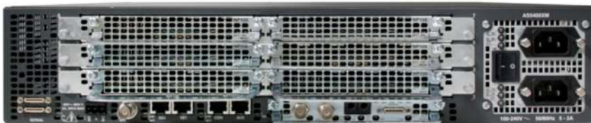
Figure 2. Cisco AS5400XM Universal Gateway Chassis View

The Cisco AS5400XM Universal Gateway provides all the system components that service providers have come to expect from carrier-class products as well as all the routing, WAN, and QoS features that are the hallmark of Cisco routing products. The Cisco AS5400XM uses a 750-MHz Reduced Instruction Set Computer (RISC) microprocessor with a 256-KB secondary cache and 512 MB of main memory. It offers the option of a redundant AC or DC power supply and has seven slots that can contain trunk and high-density packet voice/fax or universal port DSP feature cards. The Cisco AS5400XM architecture uses multiple data and control paths between feature cards and the motherboard to optimize media and signaling traffic for unparalleled performance (Figure 2).