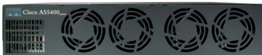
Figure 1. Cisco AS5400XM Universal Gateway

The Cisco AS5400XM Universal Gateway (Figure 1) doubles the performance of the Cisco AS5400 and delivers significant memory enhancements to offer high performance and high reliability in a compact, modular design. The Cisco AS5400XM High-Density Packet Voice/Fax Feature Card (AS5X-FC) and DSP Module (AS5X-PVDM2-64) available for the Cisco AS5400XM Universal Gateway enable higher-density configurations and world-class performance for intelligent packet voice services. The Cisco AS5400XM Universal Gateway (Figure 1) also supports existing Cisco AS5400 and AS5400HPX features, trunk termination, and universal port DSP feature cards in a more powerful chassis to help ensure continuing network investment protection. This cost-effective platform is ideally suited for service provider and enterprise environments that require innovative voice, fax, and data services.