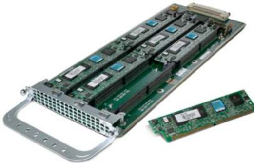
Figure 6. Cisco AS5400XM Universal Gateway High-Density Packet Voice/Fax Feature Card and DSP Module

It is easy to integrate the high-density packet voice/fax feature card and DSP module into existing Cisco AS5400XM Universal Gateway networks. The new feature card and DSP module operate on the gateway without any changes to the Cisco IOS Software configuration file in use for existing universal port DSP feature cards, making network upgrades simple. Current configurations are automatically updated.