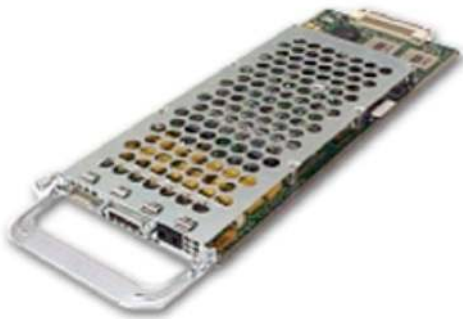
Figure 3. Cisco AS5400XM Universal Gateway 8-Port Termination Feature Card

The following is a brief description of the trunk types supported: