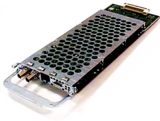
Figure 5. Cisco AS5400XM CT3A Termination Feature Card

When provisioned as a CT3 trunk, the CT3 interface cards provide physical termination for CAS, PRI, or IMT trunks, and include CSUs that connect directly to the telco network (Figure 5). The CT3 interface card provides physical-line termination for a CT3 ingress trunk line. It uses an onboard multiplexer to multiplex 28 CT1 lines into a single CT3 line. Nonintrusive monitoring of individual T1/E1 signals is available at the front of the T1/E1 termination card with standard 100-ohm bantam jacks.