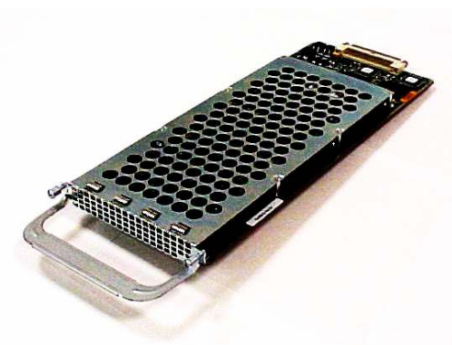
Figure 7. Cisco AS5400XM Universal Gateway 60- and 108-Universal Port Feature Card

The Cisco AS5400XM Universal Gateway 60- and 108-Universal Port Feature Cards are full-featured DSP-based cards that support 60 (on the former) or 108 (on the latter) voice, fax, and data calls. DSP-management features are available for troubleshooting, including DSP status, real-time call-in-progress statistics, DSP activity log, hard and soft busy out, and DSP firmware upgrade. Additional information can be obtained through the console, SNMP, or RADIUS accounting with the call-tracker feature (Figure 7).