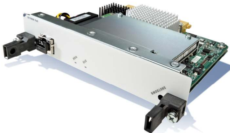
Figure 1. Cisco WebEx Node for Cisco ASR 1000 Series

This capability will allow much of the “heavy lifting,” including voice, video, and desktop sharing, required for large-scale WebEx meeting application deployments to be moved to the internal side of the proxy server/firewall infrastructure. This will reduce the load on the proxy server/firewall infrastructure and will also substantially reduce the peak bandwidth requirements for a large enterprise. The meeting switching fabric is fully distributed across the WebEx collaboration cloud and the WebEx node infrastructure within the enterprise. Attendees on the public Internet will still connect to the WebEx hosted infrastructure. VoIP/video performance and overall latency for the service will be substantially improved. Figures 2 and 3 compare what the deployment looks like when deploying WebEx with and without the Cisco WebEx node on the Cisco ASR 1000 Series.