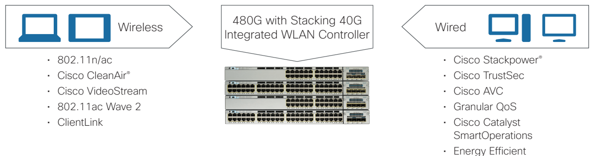
Figure 2. Cisco Unified Access Converges Wired and Wireless

Today's leading businesses are using the latest technologies to constantly reinvent themselves to disrupt the market. To keep pace with this speed-of-change, you need new capabilities that drive business innovation through IT simplicity and insights through network data analytics.