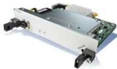
Figure 3. Cisco ASR 1000 Series SPA Interface Processor