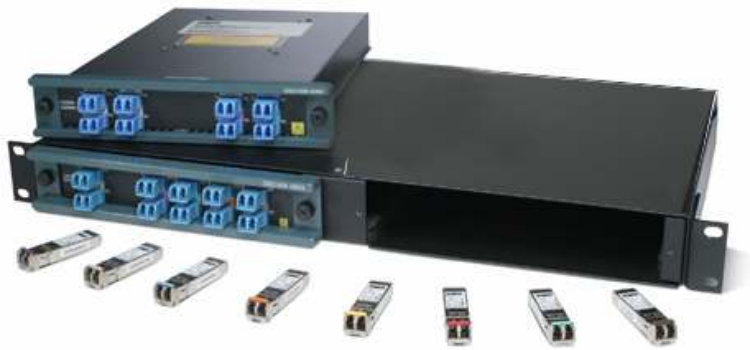
Figure 9. Cisco CWDM Extended Distance SFP Solution

The Cisco CWDM SFP solution enables the transport of up to eight channels over one pair of single-mode fiber strands, enabling enterprises to increase the bandwidth of an existing optical infrastructure without adding new fiber strands. The solution can be used in parallel with other Cisco SFP devices on the same platform.