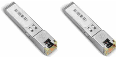
Figure 5. Cisco Copper Gigabit Ethernet SFP

To enable even more cabling flexibility, the Cisco MDS 9000 family offers a copper Gigabit Ethernet SFP. Based on the 1000BASE-T standard, the Cisco Copper Gigabit Ethernet SFP (Figure 5) provides cost-effective connectivity for data center applications. The Cisco Copper Gigabit Ethernet SFP (part number DS-SFP-GE-T) allows a user to use standard Category-5 unshielded twisted pair (UTP) cabling for Ethernet connectivity.