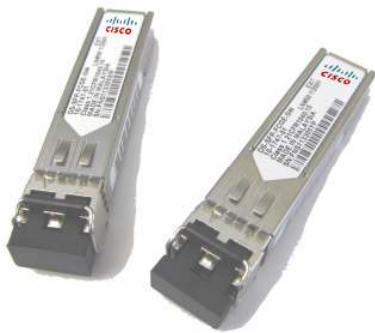
Figure 4. Cisco Tri-Rate Multiprotocol SFPs

There are two types of Cisco Tri-Rate Multiprotocol SFP (Figure 4): the Cisco Tri-Rate Multiprotocol Shortwave SFP (part number DS-SFP-FCGE-SW) and the Cisco Tri-Rate Multiprotocol Longwave SFP (part number DS-SFP-FCGE-LW). Each product offers autosensing 1/2-Gbps Fibre Channel connectivity and 1-Gbps Ethernet connectivity.