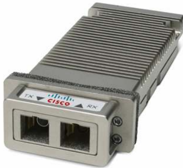
Figure 7. Cisco 10-Gbps Fibre Channel CX4 X2 Transceiver (Part Number DS-X2-FC10G-CX4)