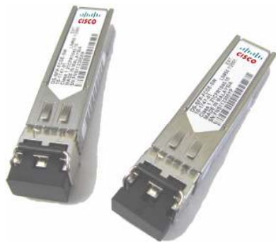
Figure 2. Cisco 4-Gbps Fibre Channel SFPs

The Cisco 4-Gbps Fibre Channel SFPs (Figure 2) are designed to provide cost-effective Fibre Channel connectivity for the 1/2/4-Gbps ports on the Cisco MDS 9000 family platform. There are three types of Cisco 4-Gbps Fibre Channel SFP: the Cisco Fibre Channel Shortwave SFP (part number DS-SFP-FC4G-SW), the Cisco 4-km Fibre Channel Longwave SFP (part number DS-SFP-FC4G-MR), and the Cisco 10-km Fibre Channel Longwave SFP (part number DS-SFP-FC4G-LW). Each product offers 1/2/4-Gbps autosensing Fibre Channel connectivity.