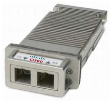
Figure 8. Cisco 10-Gbps Ethernet X2 Transceiver

The Cisco Ethernet X2 Transceiver Short Reach (up to 300 m; part number DS-X2-E10G-SR) enables high-performance Fibre Channel connectivity for the Cisco MDS 9000 family 10-Gbps Fibre Channel switching module to an existing Ethernet Dense Wavelength-Division Multiplexing (DWDM) transponder (Figure 8). The data format transmitted by the Ethernet X2 transceiver (DS-X2-E10G-SR) onto the fiber is identical to that transmitted by the Fibre Channel transceiver (DS-X2-FC10G-SR), except that the Fibre Channel packets are clocked at the 10 gigabit Ethernet rate, which allows Fibre Channel packets to be carried over an existing 10-Gbps Ethernet DWDM infrastructure. The Cisco MDS 9000 family 10-Gbps Fibre Channel switching module will automatically detect DS-X2-E10G-SR; no software configuration is required.