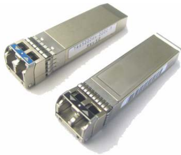
Figure 3. Cisco 8-Gbps Fibre Channel SFP+

The Cisco 8-Gbps Fibre Channel SFP+ (Figure 3) is designed to provide Fibre Channel connectivity for the 2/4/8-Gbps ports on the Cisco MDS 9000 family platform. There are two types of Cisco 8-Gbps Fibre Channel SFP+: the Cisco Fibre Channel Shortwave SFP+ (part number DS-SFP-FC8G-SW) and the Cisco Fibre Channel Longwave SFP+ (part number DS-SFP-FC8G-LW). Each product offers 2/4/8-Gbps autosensing Fibre Channel connectivity.