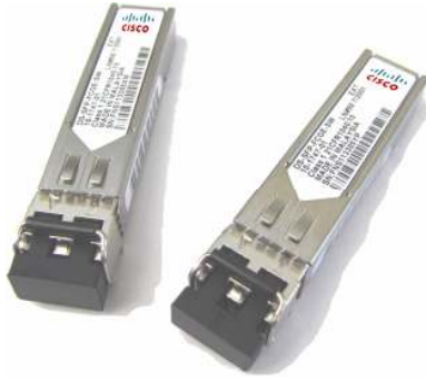
Figure 1. Cisco 2-Gbps Fibre Channel SFPs