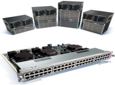
Cisco Catalyst 4500E with Cisco UPOE