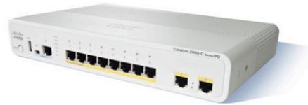
Cisco Catalyst 3560-C and 2960-C

Cisco® Universal Power over Ethernet (UPOE) is the next generation of PoE solution, which doubles the power per port to 60W. UPOE is available on the world's most widely deployed modular access switching platform: the Cisco Catalyst® 4500E. UPOE enables secure Ethernet connectivity for applications in locations that might not have sufficient Ethernet cable drops or power outlets to support the IP devices required to provide essential services.