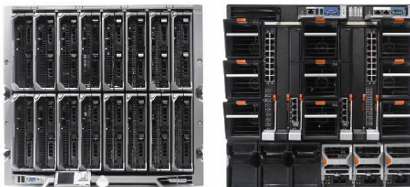
Figure 1: Front and Back Views of Dell PowerEdge M1000e Enclosure

The Dell PowerEdge M1000e enclosure provides redundant power, cooling, and management infrastructure for the blades and I/O modules. The FlexIO architecture of the Dell PowerEdge M1000e, of which Cisco Catalyst Blade Switches are a crucial part, enables exceptional I/O flexibility and bandwidth.