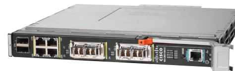
Figure 2: Cisco Catalyst Blade Switch 3032 for Dell M1000E

The Cisco Catalyst Blade Switch 3032 for Dell M1000E (Figure 2) provides Dell customers with an integrated switching solution that dramatically reduces cable complexity by eliminating the need for each server blade to be networked individually. The Cisco Catalyst Blade Switch 3032 for Dell M1000E provides the following hardware configuration: 16 internal gigabit Ethernet ports connected to servers through the Dell M1000e backplane, up to eight gigabit Ethernet uplinks, one external console port.