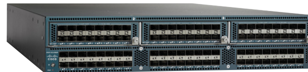
Figure 3. Cisco UCS 6296UP 96-Port Fabric Interconnect

The Cisco UCS 6200 Series Fabric Interconnects fit into the access layer as defined in Cisco's broad unified computing strategy and provide a differentiated solution for x86-based servers and the data center. Cisco UCS fabric interconnects are a required component of Cisco UCS B-Series systems and can enhance and augment network design and architecture by combining with Cisco Nexus® 5000 Series Switches (unified I/O, LAN, and SAN terabit-class access-layer Cisco switches), Cisco Nexus 1000V Series Switches (soft switches), Cisco Data Center Virtual Machine Fabric Extender (VM-FEX) technology, and Cisco Nexus 2000 Series Fabric Extenders for Cisco UCS C-Series Rack-Mount Server aggregation.