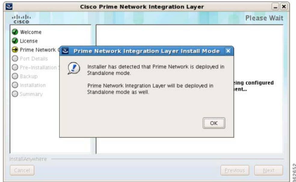
Figure 10-1 PN-IL Installation Wizard - Prime Network Credentials