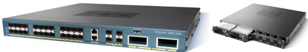
Figure 1. Cisco Catalyst 4928 10 Gigabit Ethernet Switch with Hot-Swappable Fan Tray and Power Supplies

The Cisco Catalyst 4928 10 Gigabit Ethernet Switch offers 28 wire-speed 1000BASE-X Small Form-Factor pluggable (SFP) ports and 2 wire-speed 10 Gigabit Ethernet (X2 optics) ports. Exceptional reliability and serviceability are delivered with optional internal AC or DC 1 + 1 hot-swappable power supplies and a hot-swappable fan tray with redundant fans (Figure 1).