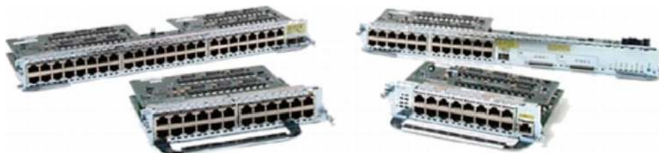
Figure 1. Cisco EtherSwitch Service Modules with IEEE 802.3af Support

The new Cisco EtherSwitch service modules, pictured in Figure 1, greatly expand the capabilities of integrated switching within Cisco routers by providing support for new features such as IEEE 802.3af Power over Ethernet (PoE), local Layer 3 switching, Cisco Network Assistant and Cisco Emergency Responder, and Cisco StackWise™ interfaces (available on NME-XD-24-1S-P only), as well as common software and features with Cisco Catalyst® 3750 and 3750-E Series Switches. Additionally, the new Cisco EtherSwitch service modules are the first modules that can take full advantage of the increased performance capabilities and new form factors of the enhanced network module slot on Cisco integrated services routers. (Table 7 provides a list of supported platforms).