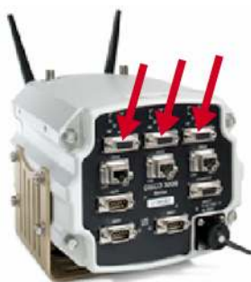
Figure 4. Cisco 3230 Rugged Enclosure, Showing Console Ports for Three WMICs

The enclosure design is similar for both the Cisco 3230 and 3270 routers. The primary differences are the number of PC/104-Plus card slots and the interface types on the I/O end cap. The interface (I/O) end caps provide interfaces to address multiple configurations. The antenna end cap contains antenna connectors, allowing up to three WMICs to be used inside the rugged enclosure.