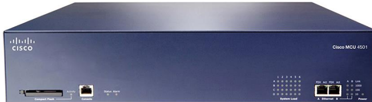
Figure 1. Cisco TelePresence MCU 4501