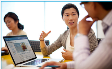
Empowers employees to focus on investigations