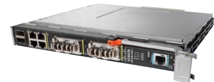
Figure 2 Cisco Catalyst Blade Switch 3100 Series

The Cisco Catalyst Blade Switch 3100 Series is another example of why most companies choose Cisco to meet their switching requirements. The Cisco Catalyst Blade Switch 3100 Series combines Cisco Catalyst heritage with product innovation to meet the unique demands of today's blade server environment.