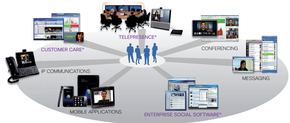
Figure 1. HCS Collaboration Applications and Capabilities