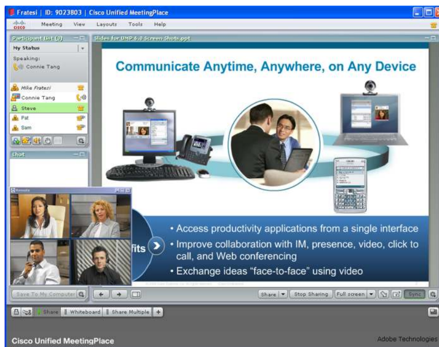
Figure 1. Share Content and Manage Your Conference with Cisco Unified MeetingPlace Web Conferencing