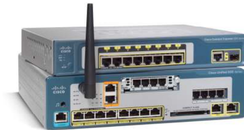
Figure 2. Cisco Unified Communications 500 Series: 24- and 32-User Configuration