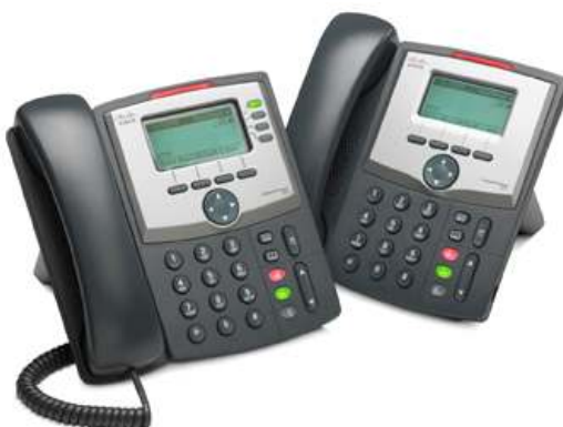
Figure 5. Cisco Unified IP Phones 500 Series

The phones in the Cisco Unified IP Phones 500 Series work exclusively with the Cisco Unified Communications 500 Series for Small Business and cannot be used with other Cisco call processing platforms.