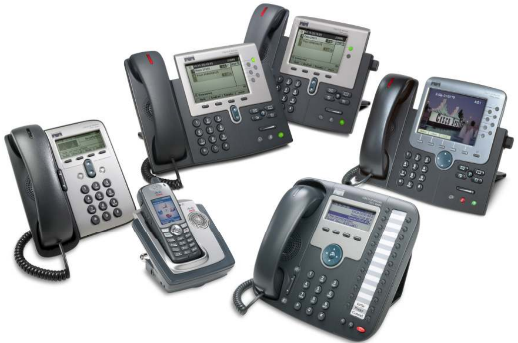
Figure 4. Cisco Unified IP Phone Portfolio

The Cisco Unified IP Phone portfolio includes options for use from wherever you are: the company lobby, the manufacturing floor, the executive suite, at home, on the road, or in a branch office (Figure 4).