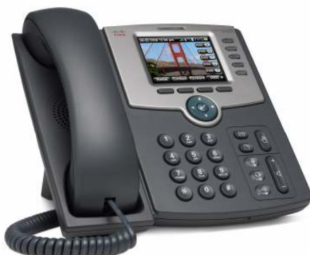
Figure 6. Cisco Small Business Pro IP Phone SPA525G

The Cisco Small Business Pro IP Phone SPA525G (Figure 6) provides 5 programmable line or feature buttons with each line being able to handle up to two active calls, four interactive soft keys that guide users through call features and functions, and an intuitive five-way navigation cluster for using menu's and applications