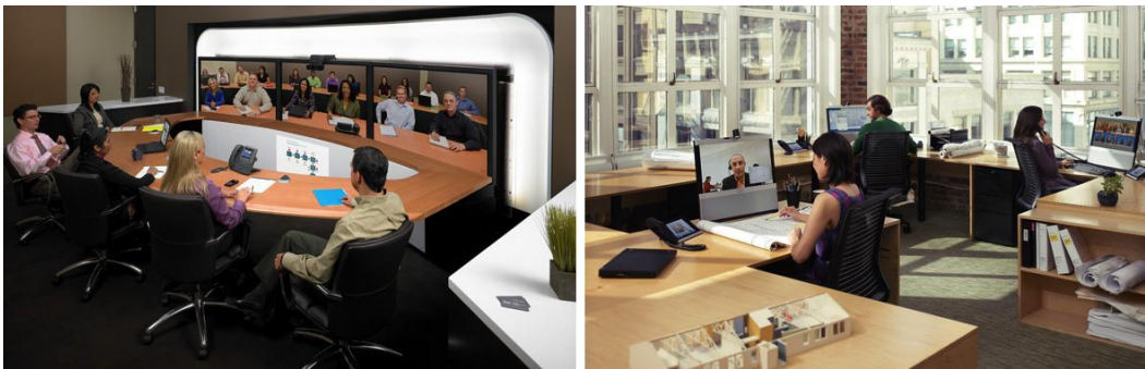
Figure 1. From the boardroom to the desktop, Cisco TelePresence powers the new way of working, where everyone, everywhere can be more productive through face-to-face collaboration

Cisco TelePresence delivers a more social, more visual, more virtual way to communicate and collaborate - with an experience so lifelike and natural that it feels like you're in the same room.