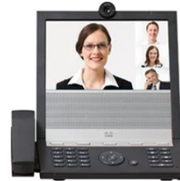
Cisco IP Video Phone E20 supports Cisco TelePresence MultiWay, which intuitively and instantly integrates multiple-party video calls.

The Cisco TelePresence™ portfolio creates an immersive, face-to-face experience over the network—empowering you to collaborate with others like never before. Through a powerful combination of technologies and design that allows you and remote participants to feel as if you are all in the same room, the Cisco TelePresence portfolio has the potential to provide great productivity benefits and transform your business. Many organizations are already using it to control costs, make decisions faster, improve customer intimacy, scale scarce resources, and speed products to market.