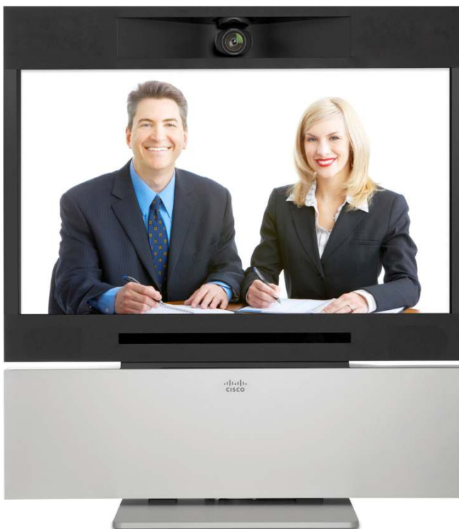
Figure 1. Cisco TelePresence System Profile Series 65-inch

The Cisco TelePresence® portfolio creates a face-to-face experience - empowering you to collaborate with others like never before. Through a powerful combination of technologies and design that allows you and remote participants to feel as if you are all in the same room, the Cisco TelePresence portfolio has the potential to provide great productivity benefits and transform your business. Many organizations are already using it to control costs, make decisions faster, improve customer intimacy, scale scarce resources, and speed products to market.