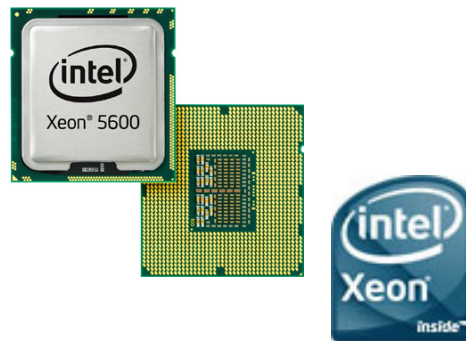
Figure 2. Intel Xeon 5600 Series

Each Cisco UCS B200 M2 uses network adapters for consolidated access to the unified fabric. This design reduces the number of adapters, cables, and access-layer switches needed for LAN and SAN connectivity. This Cisco innovation can significantly reduce capital and operating expenses, including