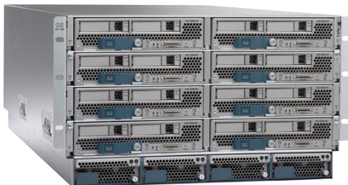
Figure 4. Cisco UCS B200 M2 Blade Servers Installed in Cisco UCS 5108 Blade Server Chassis

The Cisco UCS 5108 accepts between one and four 92-percent-efficient, 2500W hot-swappable power supplies that can be configured in a nonredundant, N+1 redundant, or grid-redundant design. Designed for efficiency at low utilization levels, the chassis power configuration provides sufficient headroom to support future blade servers hosting processors using up to 130W each.