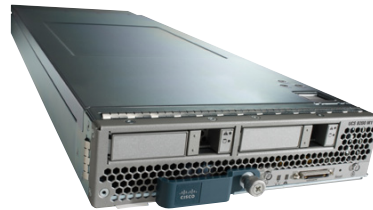
Figure 1. Cisco UCS B200 M2 Blade Server

The Cisco UCS B200 M2 is designed to increase performance, energy efficiency, and flexibility for demanding virtualized and nonvirtualized applications. Based on Intel Xeon 5600 series processors (Figure 2), Cisco UCS B-Series Blade Servers adapt processor performance to application demands and intelligently scale energy use based on utilization.