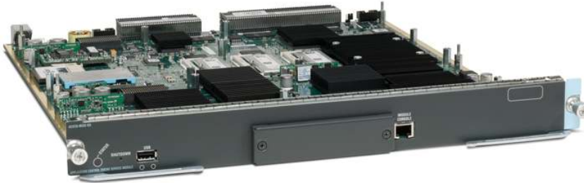
Figure 1. Cisco ACE Module for the Cisco Catalyst 6500 Series Switches and Cisco 7600 Series Routers

By combining the highest application delivery performance with a comprehensive set of state-of-the-art application delivery features, the Cisco ACE Module enhances IT efficiency and reduces the total cost of ownership (TCO). IT efficiency is increased through the use of innovative features such as virtual devices, role-based administration, instant application isolation, and single-view provisioning. Improved TCO is accomplished by consolidating most Layer 4 through 7 requirements into a complete and reliable application delivery platform.