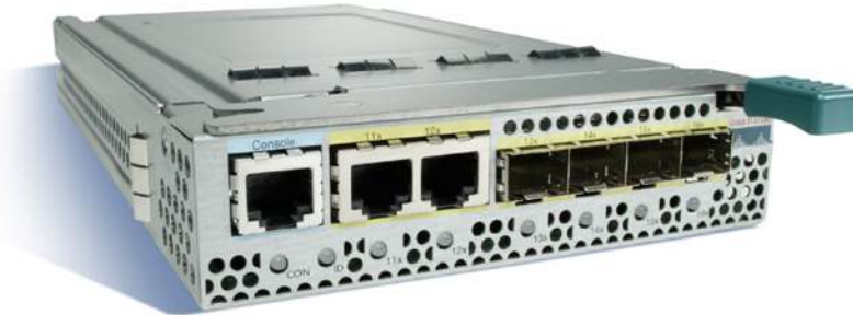
Figure 1. Cisco Catalyst Blade Switch 3040 for FSC

Cisco Systems® technology can enhance data center security, resiliency, and manageability by integrating into a FSC Blade Ecosystem. The Cisco Catalyst® Blade Switch 3040 (Figure 1) is an integrated switch for the Fujitsu Siemens Computers PRIMERGY BX600 Advanced Blade Ecosystem. FSC customers can use the Cisco Catalyst Blade Switch 3040 to extend Cisco network infrastructure services to the server edge and uses existing network equipment to help reduce operational expenses. Designed specifically for the FSC PRIMERGY BX600, the Cisco Catalyst Blade Switch 3040 helps ensure consistency across the network for advanced services such as security and resiliency. It also allows customers to use an end-to-end Cisco management framework to simplify ongoing operations.