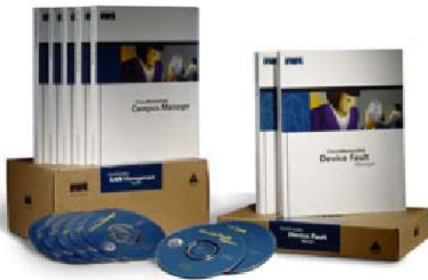
Figure 2. CiscoWorks LAN Management Solution

The Cisco Catalyst Blade Switch 3040 uses CiscoWorks, the same management framework that controls Cisco products throughout data center and enterprise networks. The CiscoWorks LAN Management Solution (Figure 2), the preferred management tool for enterprise switch platforms, can now be used to manage data center networks all the way to the server edge. The added benefits of security, resiliency, manageability, and end-to-end services deployment provide compelling operational and business benefits.