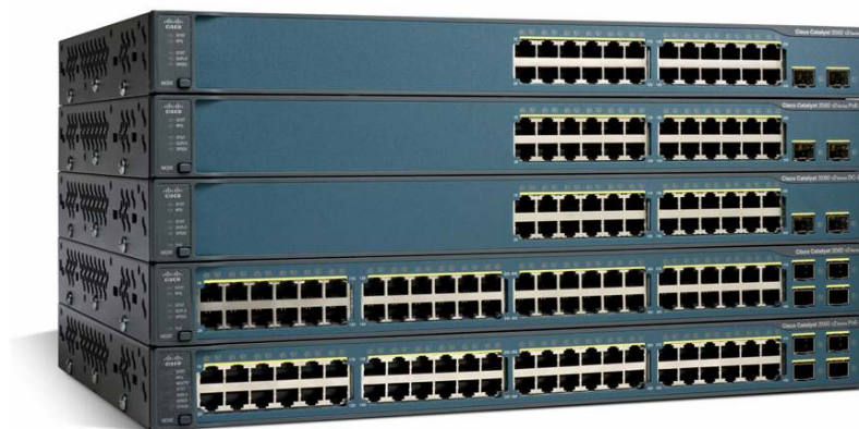
Figure 1. Cisco Catalyst 3560 v2 Switches

The Cisco® Catalyst® 3560 v2 Series (Figure 1) is the next-generation energy-efficient Layer 3 fast Ethernet switches. This new series of switches supports Cisco EnergyWise technology, which enables companies to measure and manage power consumption of network infrastructure and network-attached devices, thereby reducing their energy costs and their carbon footprint. The Cisco Catalyst 3560 v2 Series consumes less power than its predecessors and is the ideal access layer switch for enterprise, retail, and branch-office environments, as it maximizes productivity and investment protection by enabling a unified network for data, voice, and video.