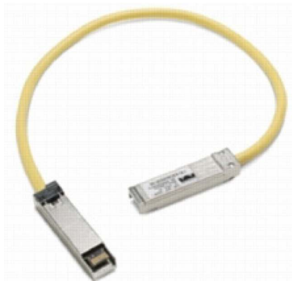
Figure 2. Cisco Catalyst 3560 SFP Interconnect Cable

The Cisco Catalyst 3560 SFP Interconnect Cable (see Figure 2) provides for a low-cost point-to-point Gigabit Ethernet connection between Cisco Catalyst 3560 v2 switches. The 50cm cable is an alternative to using SFP transceivers when interconnecting Cisco Catalyst 3560 v2 switches through their SFP ports over a short distance.