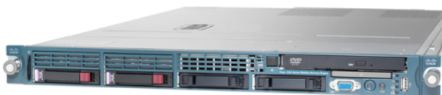
Cisco Mobility Services Engine