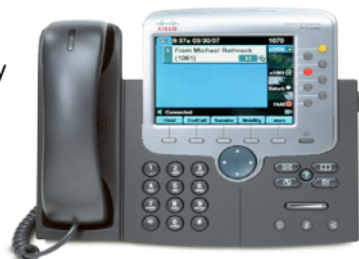
Cisco Unified Mobility