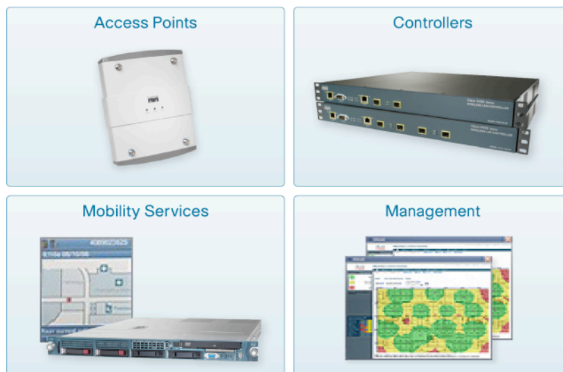
Cisco Unified Wireless Network