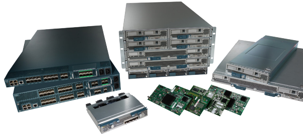
Figure 1. The Cisco Unified Computing System is Composed of Fabric Interconnects, Fabric Extenders, Blade Server Chassis, Blade Servers, Network Adapters and Extended Memory Technology (Not Shown)

Managed as a single system whether it has 1 server or 320 servers with thousands of virtual machines, the Cisco Unified Computing System decouples scale from complexity.