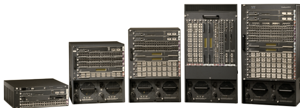
Figure 1 The Cisco Catalyst 6500 Series WS-6503, WS-C6506, WS-C6509, WS-C6509-NEBS, and WS-C6513

Although component-level redundancy is very important, a high-availability network design relies on the proper combination of individual system redundancy and overall network