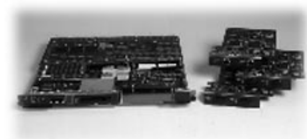
Figure 1 Supervisor III Enables the Highest Level of Performance and Functionality for the Catalyst 5000 Family

THE CATALYST® 5000 FAMILY FEATURES FIVE MODULAR CHASSIS: CATALYST 5500, CATALYST 5509, CATALYST 5505, CATALYST 5000, AND CATALYST 5002. ALL FIVE CHASSIS SHARE THE SAME SET OF INTERFACE MODULES AND SOFTWARE FEATURES, PROVIDING SCALABILITY WHILE MAINTAINING INTEROPERABILITY AND INVESTMENT PROTECTION ACROSS ALL CHASSIS. THE SWITCHES EMPLOY A FLEXIBLE SWITCHING ARCHITECTURE BASED UPON A SERIES OF SUPERVISOR MODULES—SUPERVISOR II, II G, III G, AND III—THAT PROVIDE SWITCHING, NETWORK MANAGEMENT, AND UPLINK PORTS.