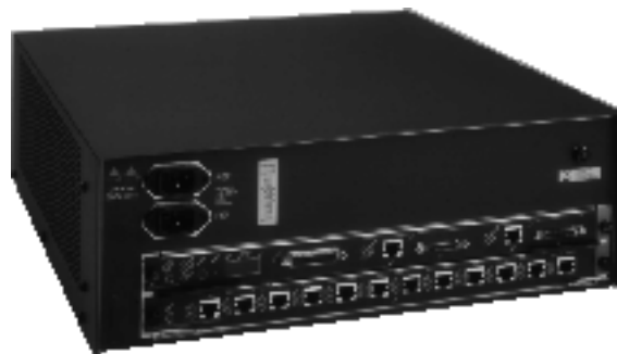
Figure 1 The Modular Catalyst 5002 Can be Configured with a Catalyst 5000 Family Supervisor Engine and Any Interface Module, Enabling Flexible Solutions

The Catalyst 5002 chassis fits into a standard 19-inch rack, and all system components are accessible from the same side of the chassis. The chassis includes dual load-sharing, redundant power supplies. A single supply can support any configuration, making the system highly reliable. The Catalyst 5002 complements the Catalyst 5000 Family, letting users benefit from common hardware, software, and spares from the data center to network periphery.