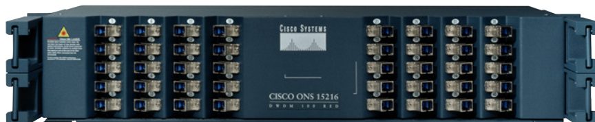
Figure 2 Cisco ONS 15216 Upgrade Blue Filter