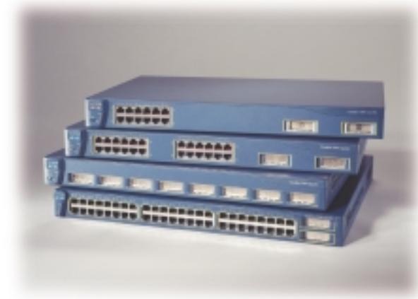
Figure 1 The Catalyst 3512 XL, Catalyst 3524 XL, and Catalyst 3548 XL are autosensing 10/100 switches for creating high-performance LANs. The switches provide 12, 24, or 48 10/100 ports and two built-in GBIC-based Gigabit Ethernet ports with up to 8.0 million packets per second performance.

The Catalyst 3500 XL switches are ideal for providing desktop connectivity in a variety of network applications. The 12-port Catalyst 3512 XL offers low port density at a low entry price. Catalyst 3524 XL and Catalyst 3548 XL switches deliver dedicated 10- or 100-Mbps bandwidth to individual users and servers at a low per-port price. All three desktop switches have dual GBIC-based Gigabit Ethernet ports that provide an ultra-flexible and scalable solution for Gigabit Ethernet uplinks or GigaStack GBIC stacking solutions. The switches are easy to deploy, either on a desktop or in a wiring closet, and feature Cisco IOS® software support. Administration of Cisco desktop Catalyst switches is made even more convenient using the Cisco Switch Clustering multidevice management technology.