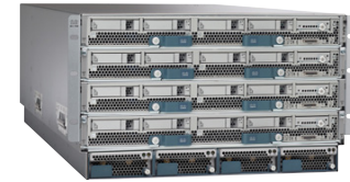
Figure 5. Cisco UCS B440 M1 Blade Servers Installed in Cisco UCS 5108 Blade Server Chassis

The Cisco UCS 5108 chassis accepts between one and four 92-percent-efficient, 2500W hot-swappable power supplies that can be configured in a nonredundant, N+1 redundant, or grid-redundant design. Designed for efficiency at low utilization levels, the chassis power configuration provides sufficient headroom to support blade servers hosting processors using up to 130W each.