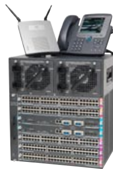
Figure 1. Managing Switches, Access Points and IP Phones

With features such as Cisco Smartports Advisor and Troubleshooting Advisor (on the Cisco Catalyst® Express 500 Series Switches), Cisco Network Assistant can review network configurations and recommend changes based on CCIE® best practices. These recommendations cover quality of service (QoS), security, and availability, thereby saving valuable time for IT administrators while helping ensure that the network is protected with the rich security and QoS features required to support new applications.