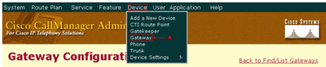
Figure 3 Device > Gateway Selection