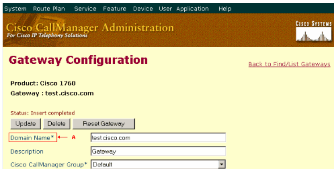
Figure 4 Gateway Configuration

If the domain names for the MGCP gateway and the gateway configuration on Cisco CallManager do not match, perform one of these actions: