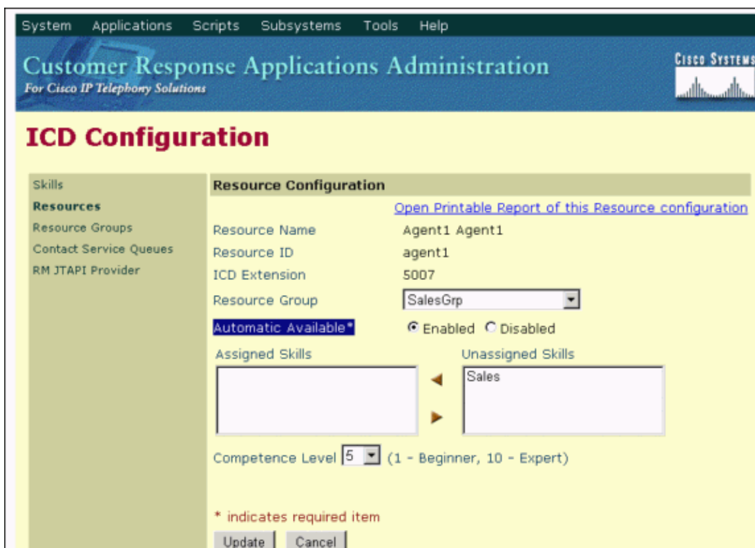
Figure 3: Cisco IP ICD Resources Configuration

In Figure 4, the information displayed in the Contact Service Queues Configuration area of the IP ICD