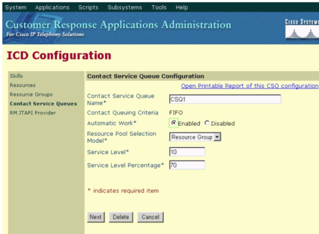
Figure 4: Cisco IP ICD Contact Service Queues Configuration

If both are configured, Automatic Work in the Contact Service Queues Configuration overrides Automatic Available in the Resources Configuration. Therefore, if an agent finishes a call and disconnects, Cisco IP ICD puts the agent into the Work State . Table 1 displays the relationship between the Automatic Work, Automatic Available, and Agent State.