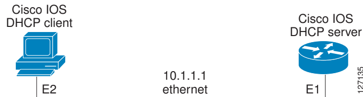
Figure 2 Topology Showing a DHCP Client with a Ethernet Interface

On the DHCP server, the configuration is as follows: