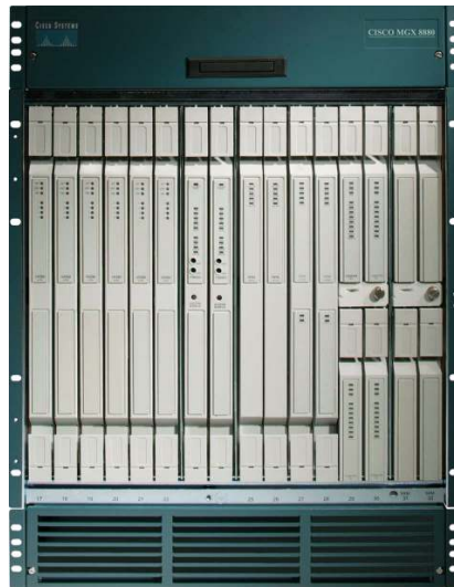
Figure 1. Cisco MGX 8880 Media Gateway

With its superior density, scalability, and performance, the Cisco MGX 8880 Media Gateway (Figure 1) helps service providers to deploy a comprehensive set of voice over IP (VoIP) applications that help lower operational expenses and generate new services revenue.