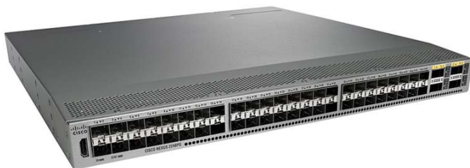
Figure 1. Cisco Nexus 2248PQ 10GE Fabric Extender

Table 1 summarizes the Cisco Nexus 2000 Series product line. Fabric extenders work in conjunction with a parent Cisco Nexus 5000, 6000, or 7000 Series Switch. Cisco Nexus 2000 Series Fabric Extenders can be mixed and matched with a parent switch to provide a variety of connectivity options.