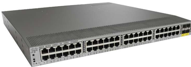
Figure 1. Cisco Nexus 2248TP-E

The Cisco Nexus 2248TP-E works in conjunction with a parent Cisco Nexus 5000 or 7000 Series Switch. The minimum software release required for Cisco Nexus 5000 Series Switches to support the Cisco Nexus 2248TP-E is Cisco ® NX-OS Software Release 5.1(3)N1(1). The Cisco Nexus 7000 Series will support the Cisco Nexus 2248TP-E in a future software release. All Cisco Nexus 2000 Series Fabric Extenders can be mixed and matched with a parent switch to provide a variety of connectivity options.