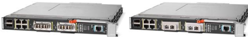
Figure 1. Cisco Catalyst Blade Switch 3130 for Dell M1000e

The Cisco Catalyst® Blade Server 3130 represents the next-generation networking solution for blade server environments. Built on the market-leading Cisco® hardware and Cisco IOS® Software, the Cisco Catalyst Blade Switch 3130 (Figure 1) is engineered with unique technologies specifically designed to meet the rigors of blade server-based application infrastructure. Specifically, the switch is designed to deliver scalable, high-performance, highly resilient connectivity while supporting ongoing IT initiatives to reduce server infrastructure complexity and total cost of ownership (TCO).