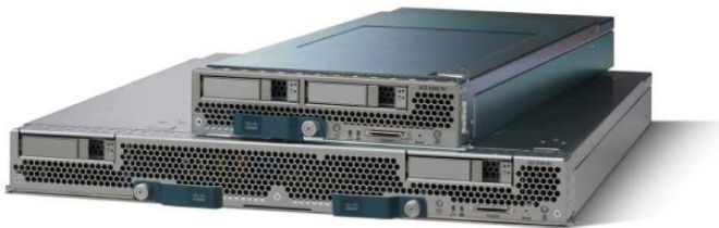
Figure 2. Cisco UCS B200 M2 and UCS B250 M2 Blade Servers

Table 1 compares the features of the Cisco UCS B-Series Blade Servers.