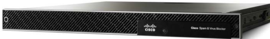
Figure 1. Cisco Spam & Virus Blocker