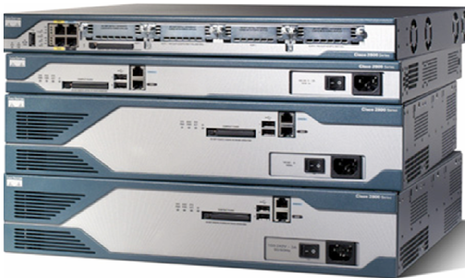
Figure 1. Cisco 2800 Series

Cisco Systems ® , Inc. redefined best-in-class enterprise and small- to- midsize business routing with a new line of integrated services routers that are optimized for the secure, wire-speed delivery of concurrent data, voice, video, and wireless services. Founded on 20 years of leadership and innovation, the Cisco ® 2800 Series of integrated services routers (refer to Figure 1) intelligently embed data, security, voice, and wireless services into a single, resilient system for fast, scalable delivery of mission-critical business applications. The unique integrated systems architecture of the Cisco 2800 Series delivers maximum business agility and investment protection.