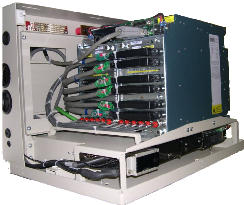
Figure 1. The Cisco ONS 15310-MA Wall Mount Enclosure (WME)

The Cisco ® ONS 15310-MA Multiservice Provisioning Platform (MSPP) is a carrier-class MSPP that efficiently switches Ethernet and time-division multiplexing (TDM) traffic for use in metropolitan and regional optical networks. Fiber-to-the-building (FTTB) applications represent an increasingly important opportunity for metropolitan service providers to extend their networks, reach new customers, and profitably grow their businesses. The Cisco ONS 15310-MA has enabled service providers to address the FTTB market because it delivers supercharged SONET/SDH, integrated optical networking, unprecedented multi-services on demand, and radical economic benefits. However, FTTB applications requires providers to deploy equipment to sites that may be unsecured, lacking standard equipment racks, without DC power sources, and/or controlled by outside parties. The Cisco ONS 15310-MA Wall Mount Enclosure (WME) provides a secure environment for the Cisco ONS 15310-MA network equipment, power system, and VRLA batteries (battery back-up) in locations powered by 120VAC with space limitations.