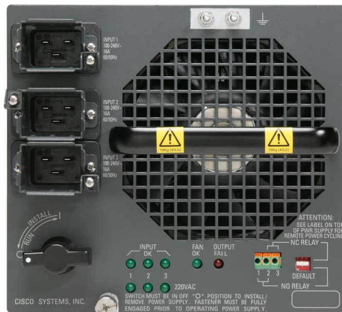
Figure 1. Cisco 8700W Enhanced AC Power Supply for Cisco Catalyst 6500 Series Switches

A. The 8700W enhanced AC power supply is a high-capacity power supply designed for Cisco® Catalyst® 6500 Series Switches for scaling the Power over Ethernet (PoE) density in a single chassis with full redundancy. With this power supply, the Cisco Catalyst 6509-E Switch chassis can support up to 420 IEEE class 3 (15.4W) PoE devices with full redundancy, thereby reducing the total cost of ownership in high-density PoE deployments.