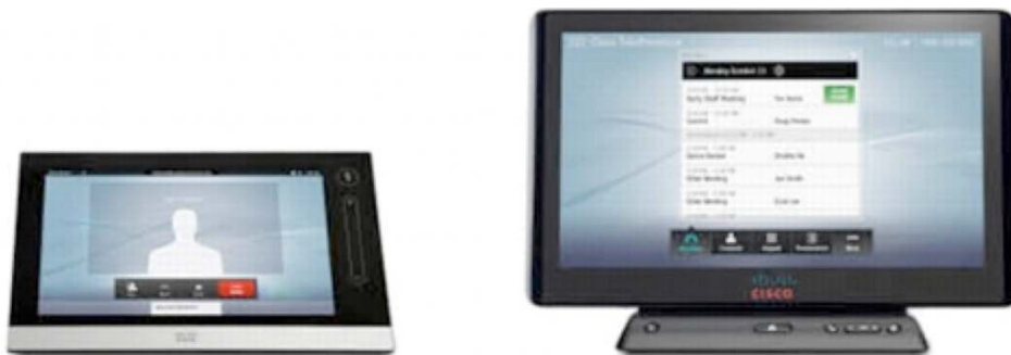
Figure 2. Eight- and 12-Inch Cisco TelePresence Touch Screens