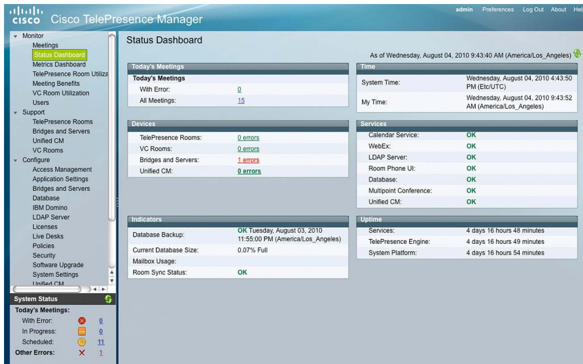
Figure 1. Cisco TelePresence Manager