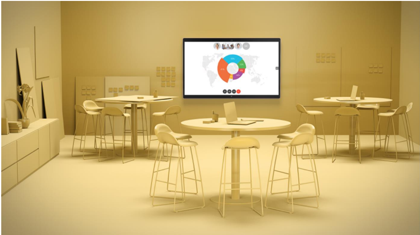
Figure 1. Cisco Webex Board 85 in a large-team environment

The Webex Board 85S*, featuring an 85-inch LED screen, is designed for your largest collaboration spaces such as auditoriums, training spaces, and classrooms, where co-creation is the primary focus. The Webex Board portfolio is also available in 55- and 70-inch options to cover all of your collaboration needs from huddle space to the boardroom.