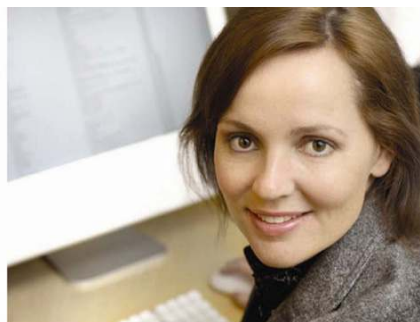
Live Video Operators

The Cisco TelePresence™ portfolio creates an immersive, face-to-face experience over the network—empowering you to collaborate with others like never before. Through a powerful combination of technologies and design that allows you and remote participants to feel as if you are all in the same room, the Cisco TelePresence portfolio has the potential to provide great productivity benefits and transform your business. Many organizations are already using it to control costs, make decisions faster, improve customer intimacy, scale scarce resources, and speed products to market.